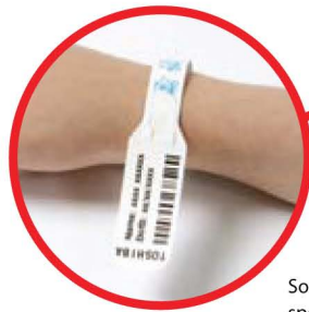
So versatile that even specialist labels and tags can be printed with ease