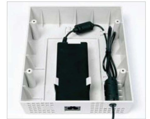
An optional power supply tray for retail installations