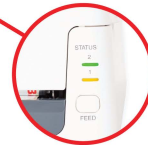
Easy operation with clear multi-coloured LED status indicator