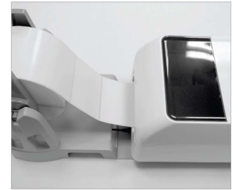
A wide range of options, including an external media stand