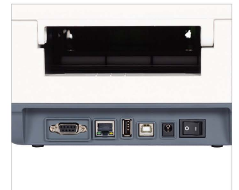
Built-in networking as standard with a 10/100Mbps LAN interface